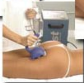
Near Infrared Massage

The BodyCell FAST equipment uses four different functions which, been applied in sequence, allow to break deeply into the fibrous parts of the cellulitis and drain away all the remaining parts through the channels of lymphatic drainage.